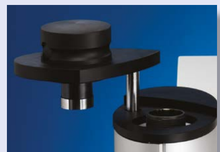
Top closure elevator for easy handling

CitoPress-5 comes with three preset cooling levels (Hi/Med/Lo). The main advantage is water saving, meaning that the MEDIUM mode can be used in most cases, and water usage reduced significantly. Thermoplastic resins require far longer cooling times than thermosetting. With CitoPress-5, the cooling level can be set to match the resin. E.g., instead of reducing the flow at the water tap, the level can be reduced by selecting the LOW mode.