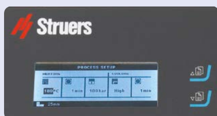
The display and touch pad controls facilitate fast selection of parameters

CitoPress-5 features a LCD display, which graphically shows parameter settings and mounting progress. Changing parameters is fast by using the touch pad controls.