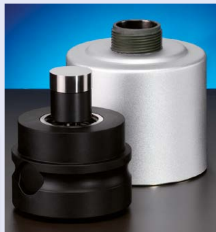
Low mass mounting unit and top closure