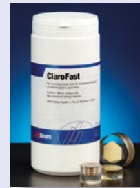
ClaroFast is a transparent hot mounting resin, offering you transparent mounts with a clear view to all sample details